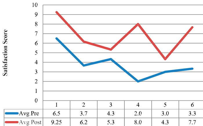
Figure 2. Wheel of life® satisfaction before and after coaching on priority goals for participants ( N=6 ).

improved from the beginning ( M = 3.80 , SD = 1.53 ) to the end of intervention ( M = 6.80 , SD 1.86 ), t = 3.85 ( p < .01 ).